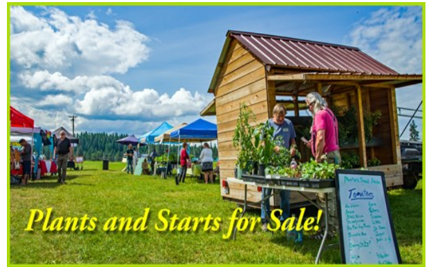
Newport Farmers Market!

The Newport Farmers Market is operating at the Rodeo Grounds at Newport City Park this year, the perfect location for this fun and lively venue! The market has a nice balance of farm-grown products, crafts, and community service information, and produce will be more available as summer progresses! Newport City Park has shaded picnic area with tables, clean restrooms, and ample parking (general public parking is next to the middle school gym off Calispel Ave, and senior parking is available by entering on W. 1st Street). An espresso vendor will open soon, and efforts are under way to have a bakery vendor, as well! Music is a feature of the market and a young man singing and playing guitar provided a very nice atmosphere for browsing. Entertainment will vary and the summer schedule and more information is available at the Market Facebook page at: